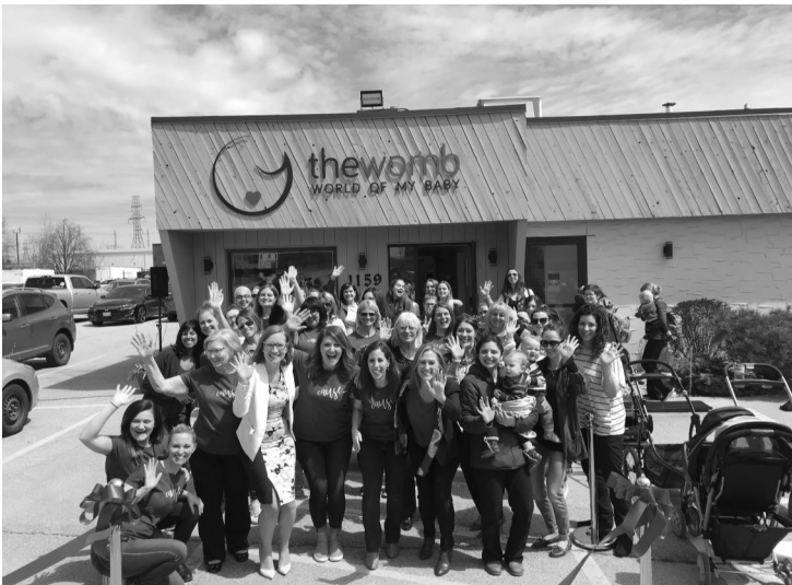
I was thrilled to attend the Grand Opening of the World of My Baby Burlington.