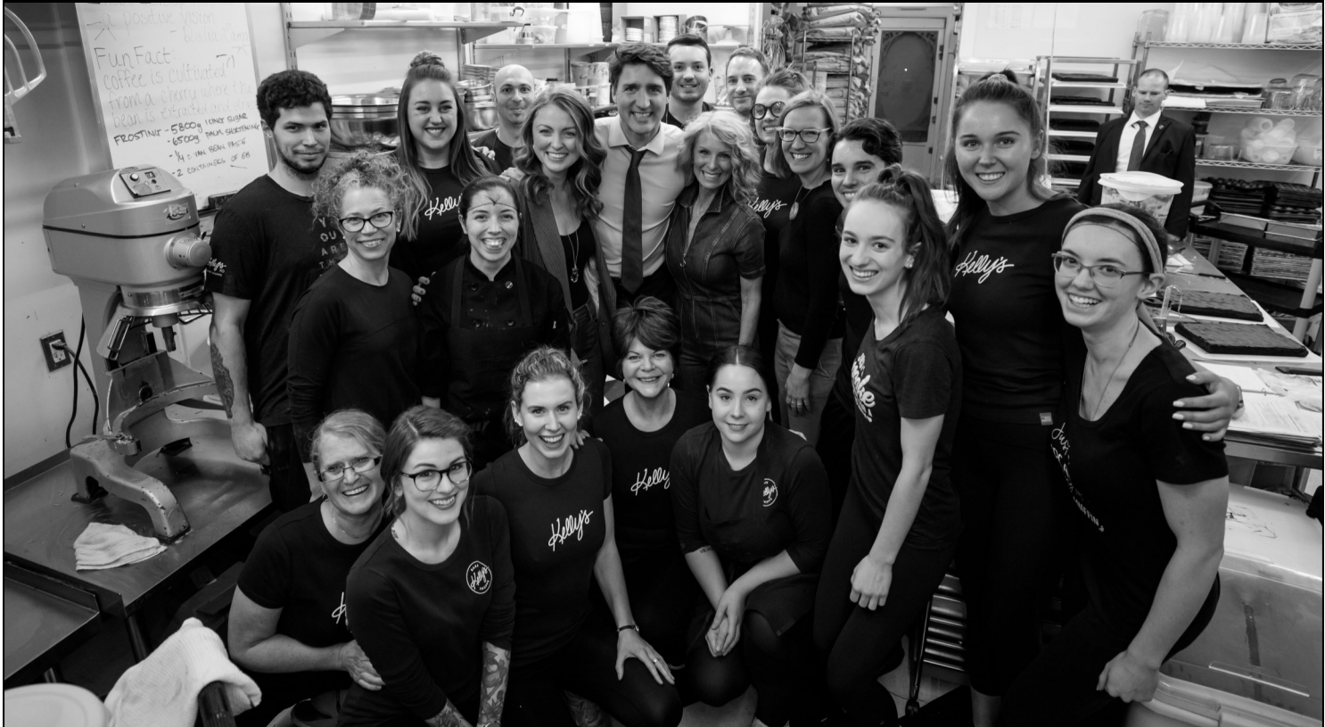
On May 9th, Minister Gould and Prime Minister Trudeau visited Kelly's Bake Shoppe, in downtown Burlington.